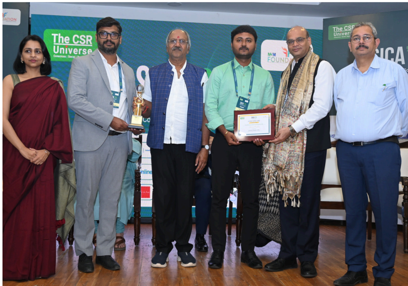
SICA '25 – The CSRUniverse Social Impact Awards. Award of Excellence in WASH category