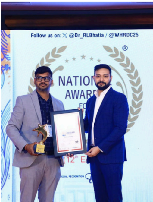
National Awards for Excellence: Award for Outstanding Contribution To Social Consciousness