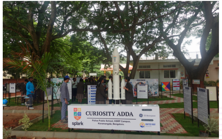
CURIOSITY ADDA allows students to experience concepts through 2D and 3D models