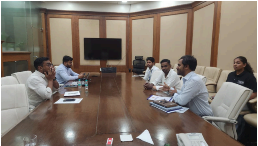
Meeting with Pune Zilla Parishad CEO, Aug 2025

This quarter, we have conducted a number of meetings with government stakeholders, as we ensure our projects and interventions are well aligned with the priorities of the districts we are working in. Meetings have been conducted with block & district administration, CDPOs, CEOs, and through Gram Sabhas in various districts of Maharashtra, Tamil Nadu, Kerala, and Karnataka.