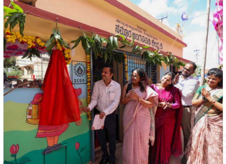
Kotak Mahindra Bank's leadership team inaugurated 30 Anganwadi Centres, refurbished in Dharwad & Gadag districts of rural Karnataka.