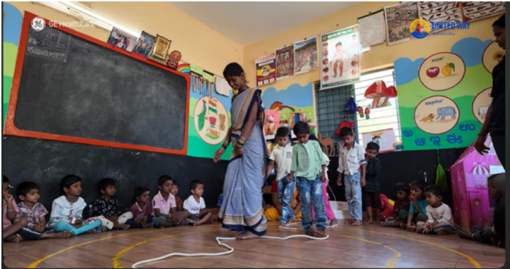
Born Learning Campaign || Raichur || UWBe X GE Healthcare