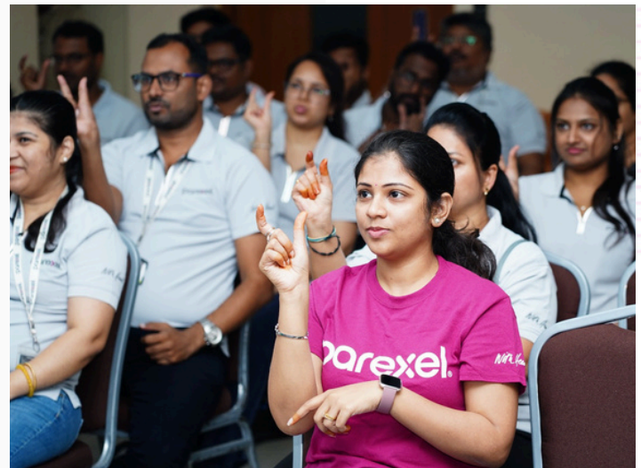
Parexel volunteers participated in a sign-language learning workshop, also engaging in activities with students of Ashray Akuti.