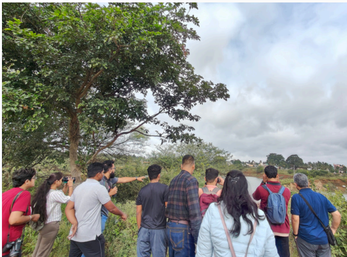
Alstom employees participated in nature walks across two lakes, exploring local birdlife and learning how to recognize different species.