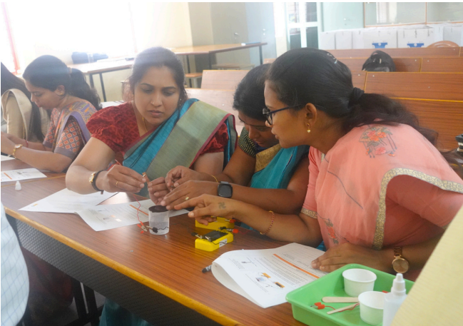
spark classrooms with teachers capacitated to demonstrate STEAM models

' spark ' campaign is kick-started, which aims at making science, technology, engineering, arts, and mathematics (STEAM) an integral and fun part of the learning process for every student by enhancing the availability and accessibility of resources for knowledge enhancement and practice.