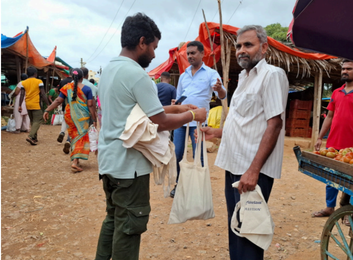
Volunteers from LM Wind Power visited Sompura, Bengaluru, distributing cloth bags at the weekly market & raising awareness on environmental sustainability.