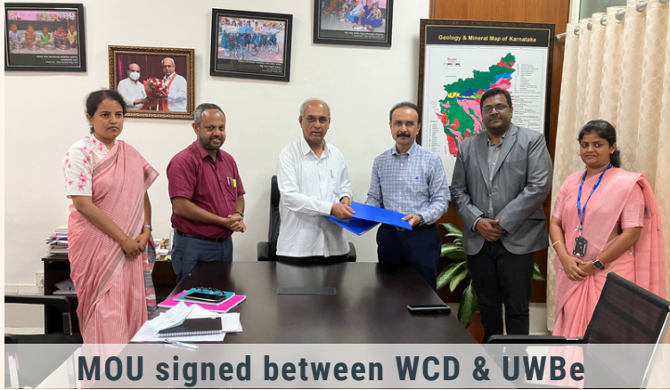
MOU signed between WCD & UWBe