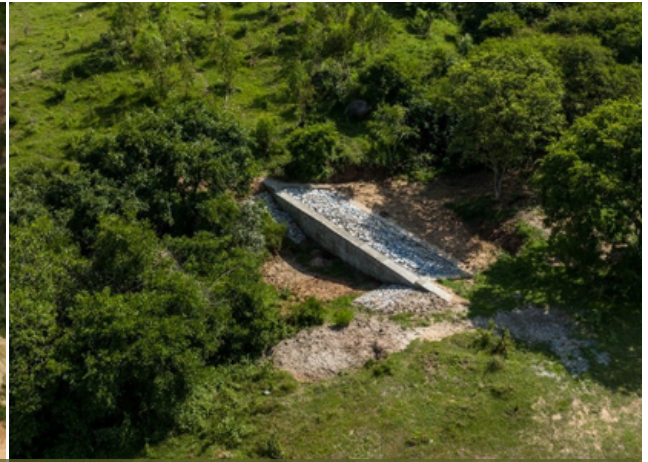
Integrated Watershed Development at Anekal Taluk