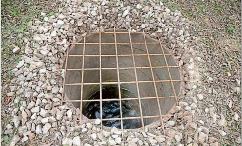
Percolation wells boost groundwater levels and prevent flooding.

Over the last few years, many non-profit organisations and a few government agencies have taken the initiative to dig up percolation wells and over two lakh such wells have been dug up across the city. In Lalbagh, where close to 300 percolation