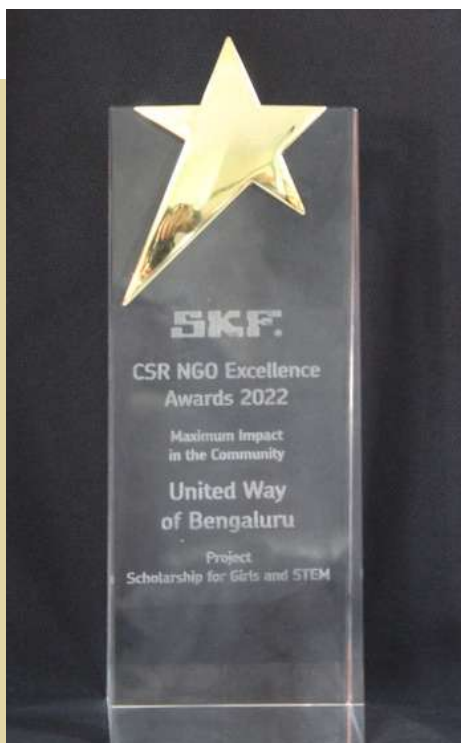
Implementation Excellence Award” by SKF for demonstrating maximum community impact for the scholarship and STEM project.