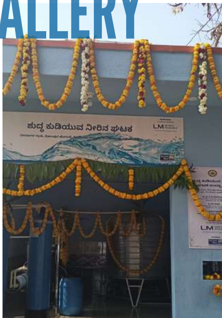
RO Unit at Nelamangala