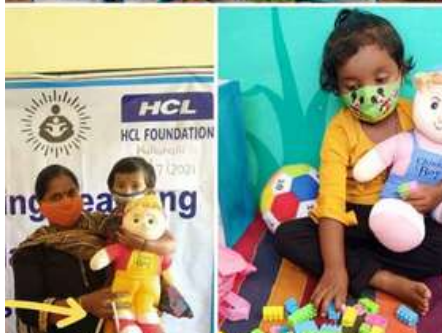
Teaching Learning Materials for Children