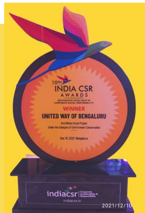
Recognized as the Winner of the India CSR Awards 2021, for one of our flagship programs - 'One Billion Drops' under the Environment Conservation category.