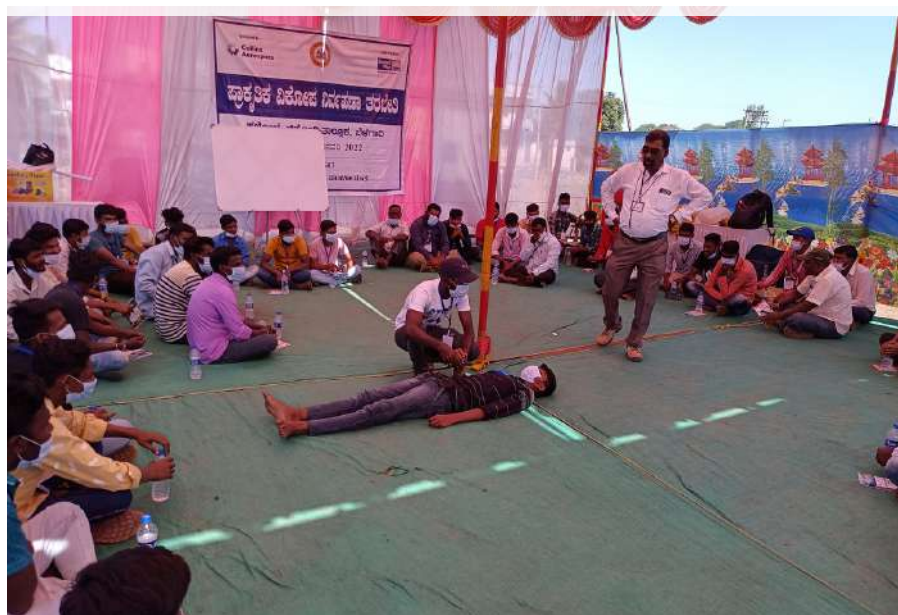
Disaster Risk Management Sessions