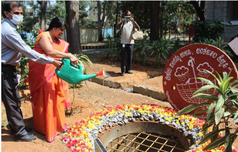
Percolation well at NIMHANS