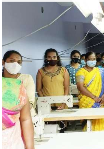
Skill Development Training