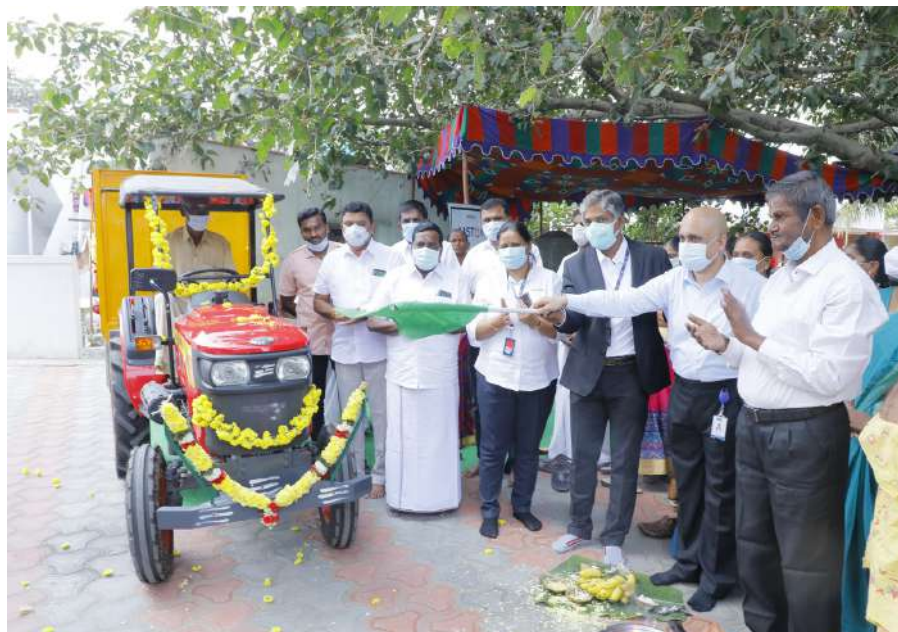
Solid Waste Management Vehicle