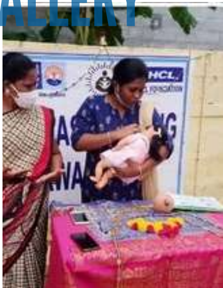
Breast Feeding Technique Demonstration