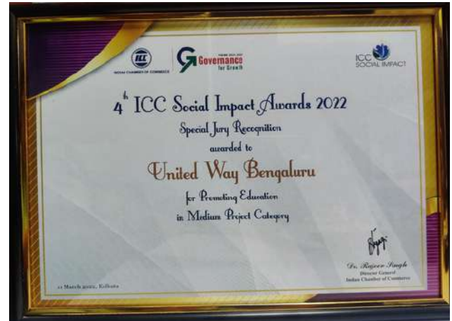
Indian Chamber of Commerce ‘Special Jury Recognition’ Social Impact Award 2022 for Born Learning Campaign