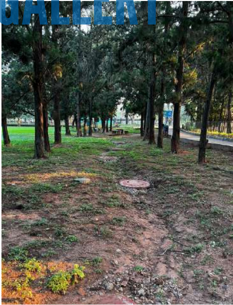
Percolation well at Lalbagh