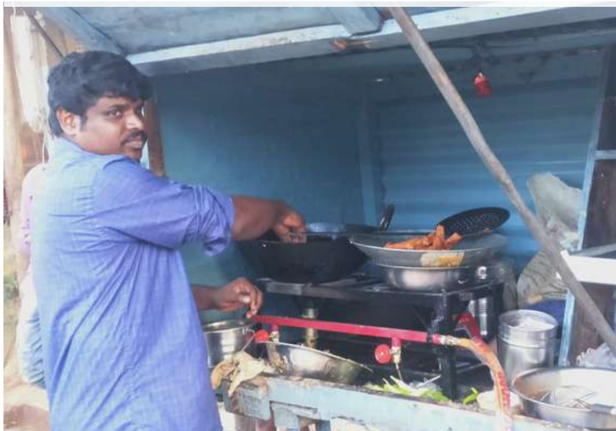
PWD's with stall