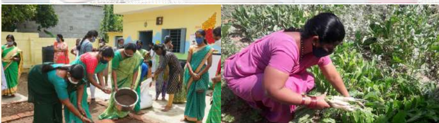
Kitchen Garden at Anganwadi Center