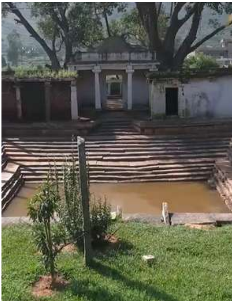
Restored Kalyani at Sultanpete