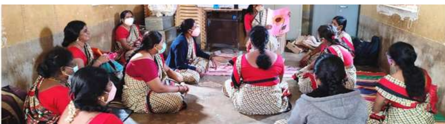
Capacity Building of Anganwadi Workers