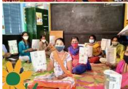
Paper Bag Making Activity