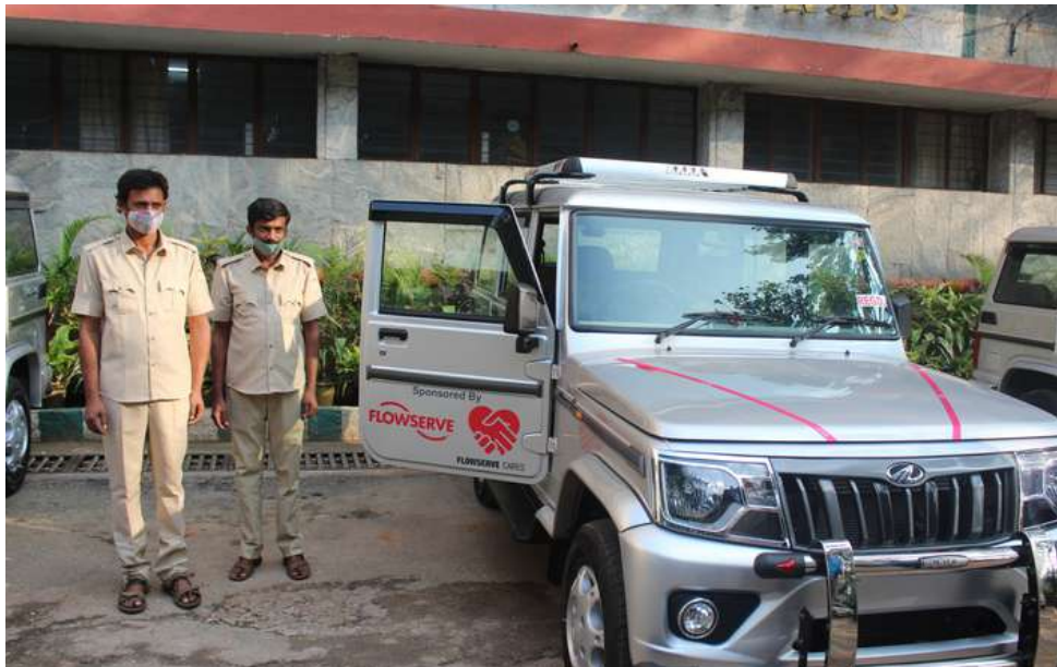
Support extended to Forest Guards and Forest Department