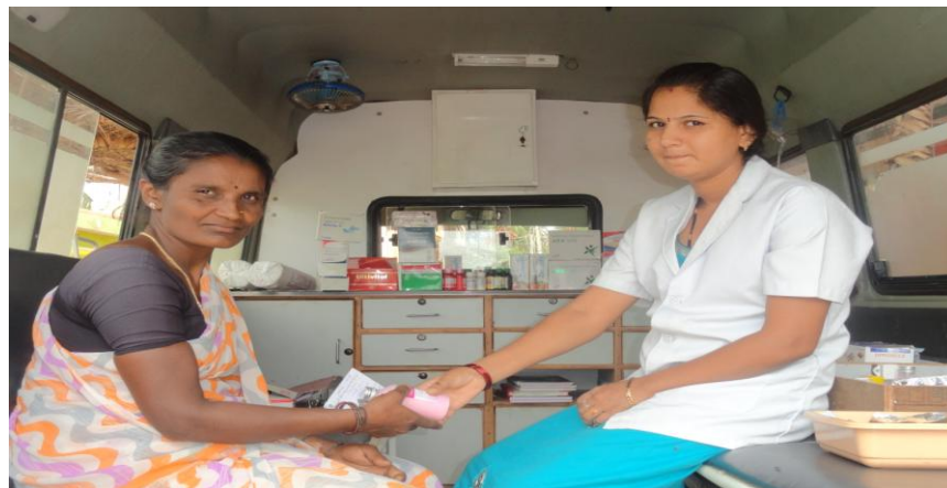
Medicines distributed to a beneficiary visiting the mobile health

United Way Bengaluru's Mobile Health Van which frequents 12 rural villages in Doddaballapur continues to serve a vast population of 12000 people. In the last one year, we have witnessed that the number of patients have reduced mainly because of timely diagnosis, intervention and the vast effort that went into educating the masses on the importance of preventing diseases through lifestyle changes, intake of nutritious food, ill- effects of smoking and drinking and other such relevant issues.