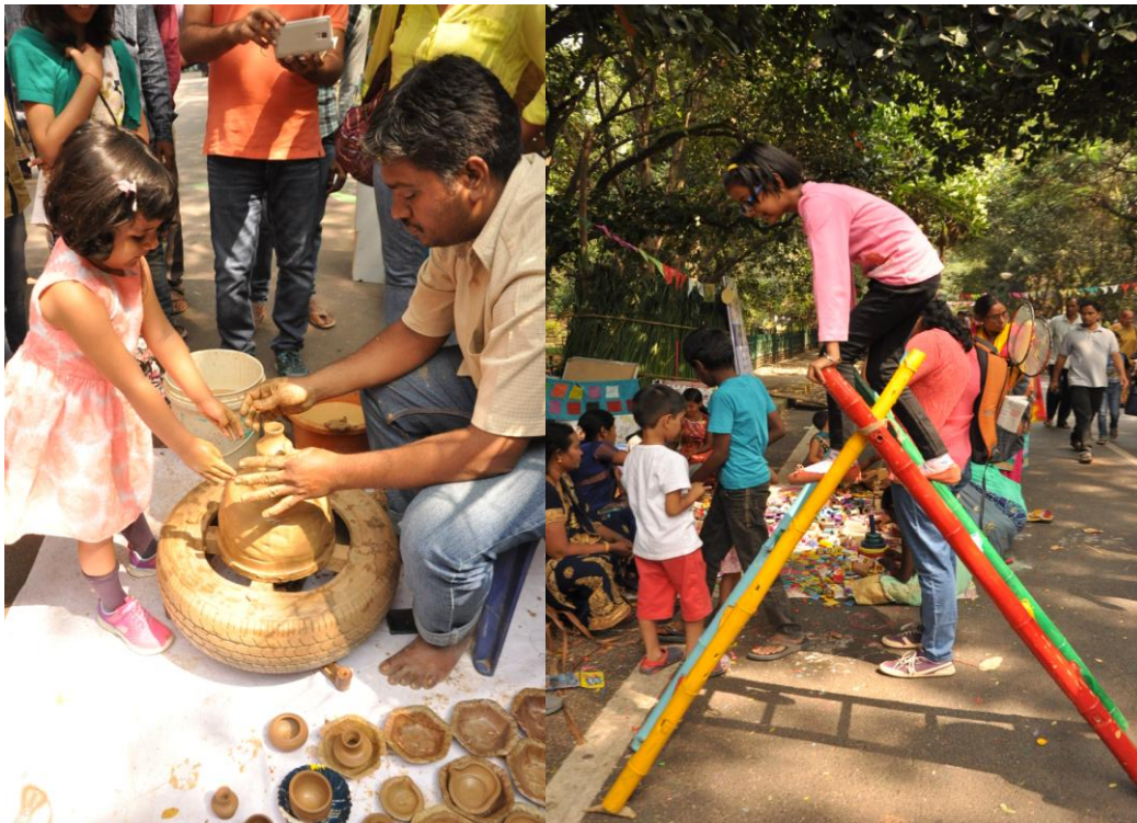
Makkala Habba, a children's carnival focused on reviving traditional games & pastimes

In Association with the Department of Women and Child Welfare, Government of Karnataka on the occasion of Children's Day, we participated in Makkala Habba, at the Cubbon Park, Bengaluru where a village was recreated and traditional games and pastimes of yore were displayed. We witnessed a footfall of over 50,000 adults and children. Both parents and children were tremendously excited with the opportunity to participate and experience these games and activities which over the years had been relegated to the past.