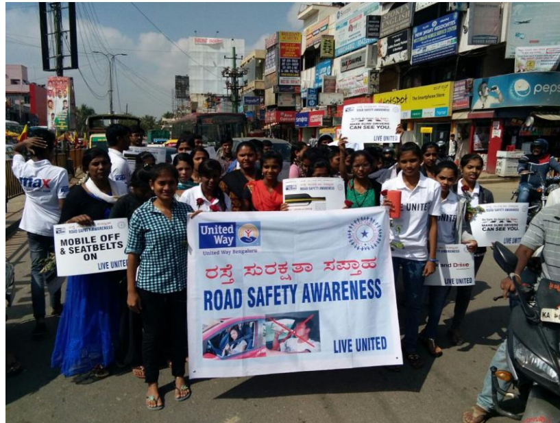
Road awareness drive organized by Student United Way