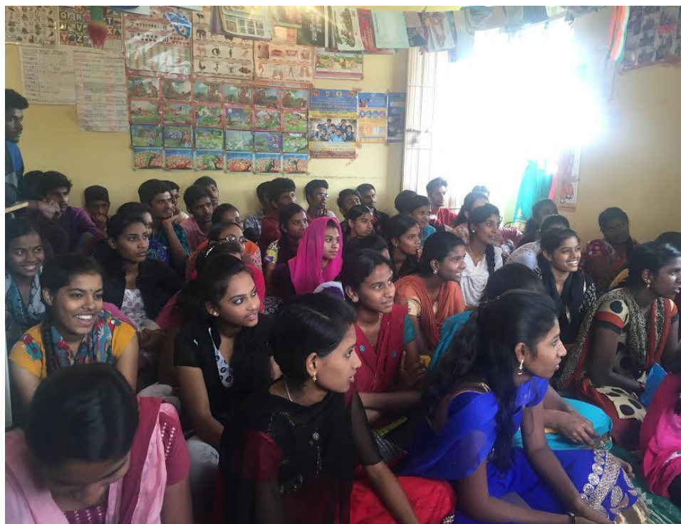
An ongoing mentoring session for beneficiary students