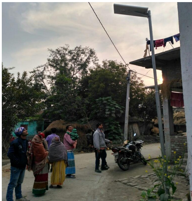
People gather to view the newly installed solar street

A health camp was organized in Marhaura and around 800 people from five villages attended with the camp enthusiasm. Nearly, 300 people received first aid kits on first come first served basis. During the camp, separate sessions for men and women were conducted on general health and hygiene. A general physical checkup like height and weight, eye testing, BP, sugar, cataract and skin diseases were undertaken. Extensive canvassing was taken in the five villages through use of auto rickshaw, distribution pamphlets, putting up banners in public spaces and organizing street plays.