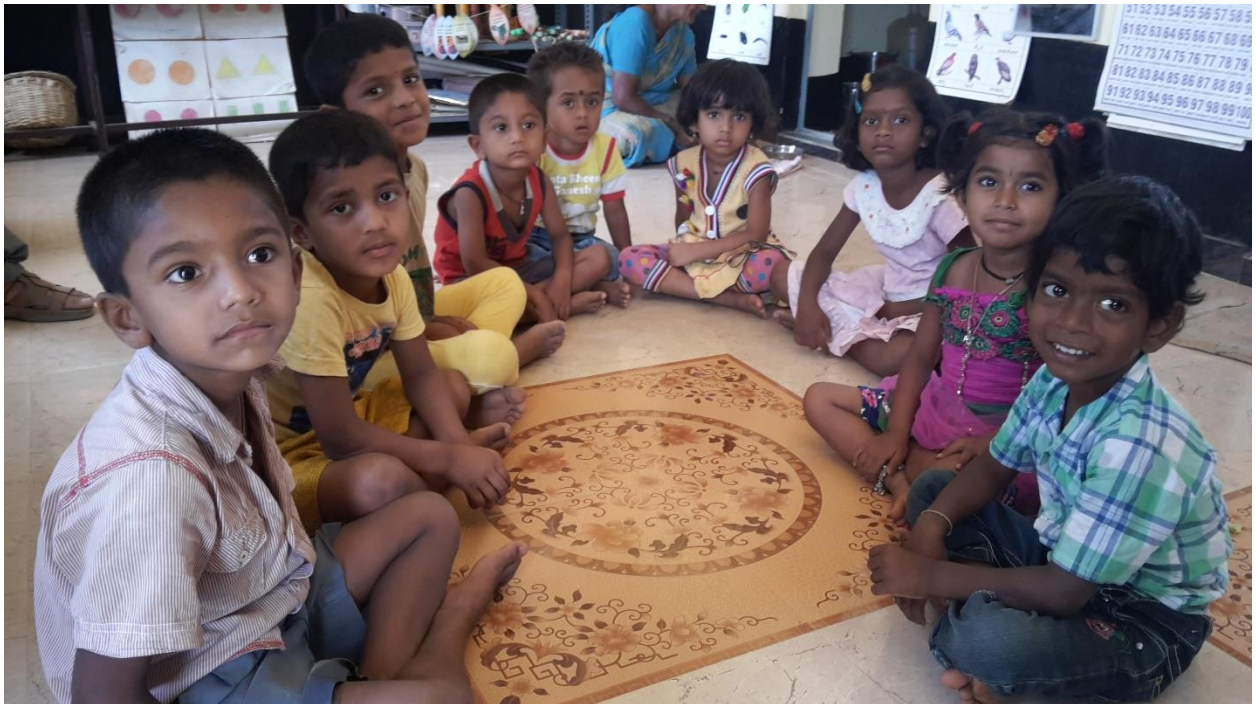
Nearly 1400 children will directly benefit from UWBe's Born Learning Campaign

United Way Bengaluru which works with children under six years of age is yet another important area which we have been advocating. The first 5 – 6 years of child's life is very critical to ensure that he or she succeeds later in life. In year 2015 Born Learning Campaign attracted the interest of Women and Child Development Department of Government of Karnataka. As our result the Born Learning campaign is presently working in 42 Government run anganwadi centers and reaching out to 1400 children to provide conducive environment by improving infrastructure, engaging mothers through Mothers' Committee and disbursing learning aid to help children learn better.