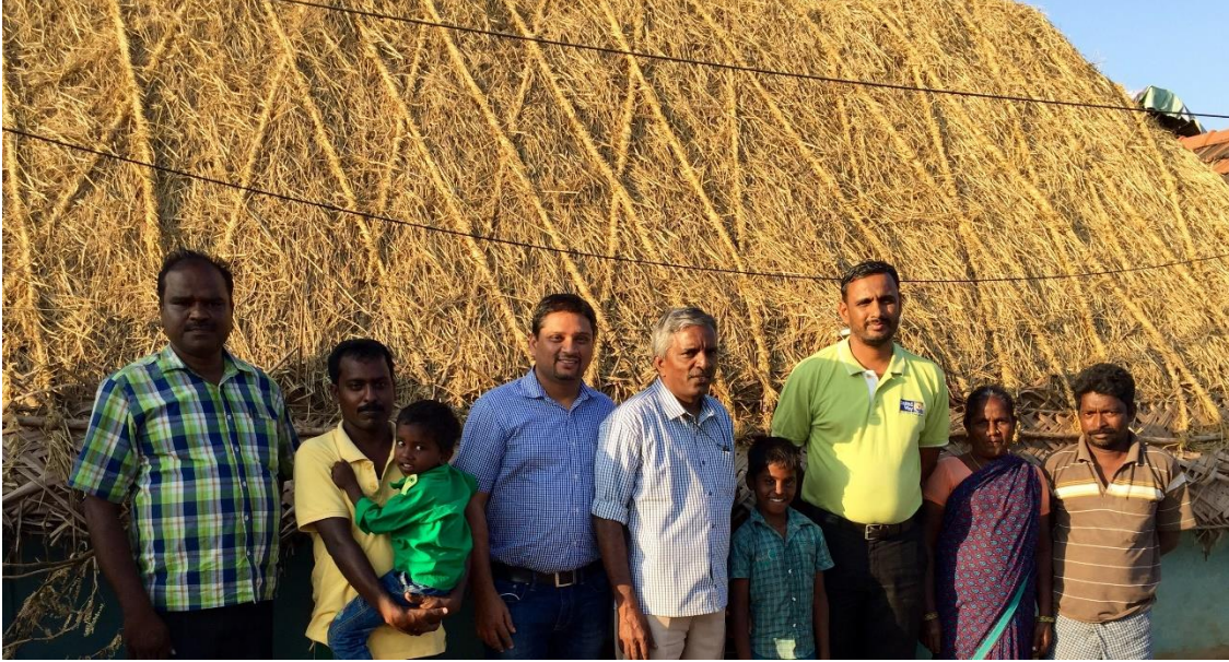
UWBe team and beneficiaries stand together against the backdrop a freshly laid thatched roof in Tiruvllur

We take this opportunity to thank all our donors, well-wishers and volunteers who helped us create an impact in the lives of deserving people from the underprivileged sections of our communities.