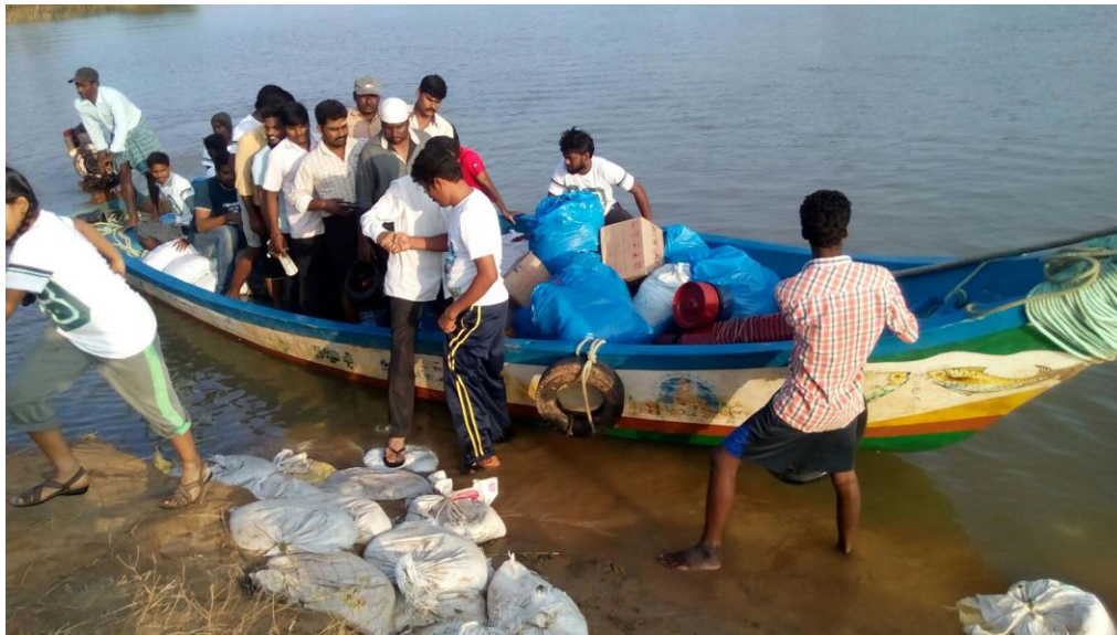
Aid material being ferried to remote villages near Tiruvallur

In the first phase, nearly 2414 people from Tiruvallu directly benefit from the relief program initiated by United Way Bengaluru and supported by various corporate partners. Aid was distributed in the form of various food materials and utility items like mosquito nets and tarpaulin sheets.